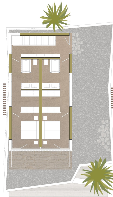
UPPER FLOOR / PLANTA ALTA